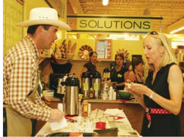
A rancher store visit at New Seasons Market.

Identity preservation through the value chain. A feature of the food value chain model is that farmers and ranchers have the right to maintain their identity or brand on the product as deeply into the supply chain as they choose. Co-branding with other value chain partners is a viable strategy 2 (See Appendix A).