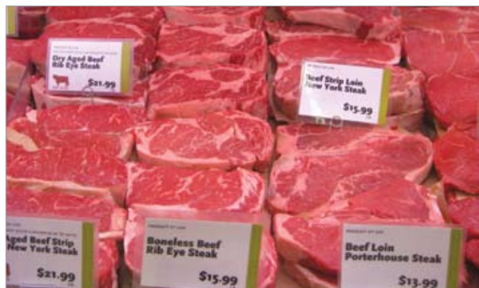
Country Natural Beef cuts in the meat case.