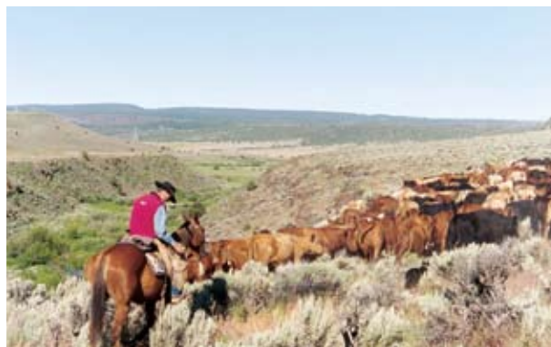
A Country Natural Beef rancher moving some heifers.

Key points in the final recommendation that was adopted by the cooperative’s members included: a) creation of a membership-based management team whose members would serve as contact persons for sets of nine to ten ranchers,