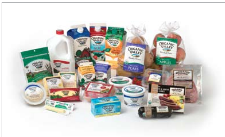
An array of Organic Valley products

In addition to the USDA Organic Certification, many Organic Valley products carry Orthodox Union Kosher Certification < www.organicvalley.coop/fileadmin/pdf/kosher.pdf >. See “Standards and certification,” page 5, for more information.