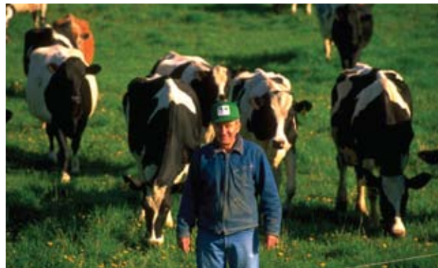
An Organic Valley dairy producer

National cooperative. See “Organizational development,” page 2.